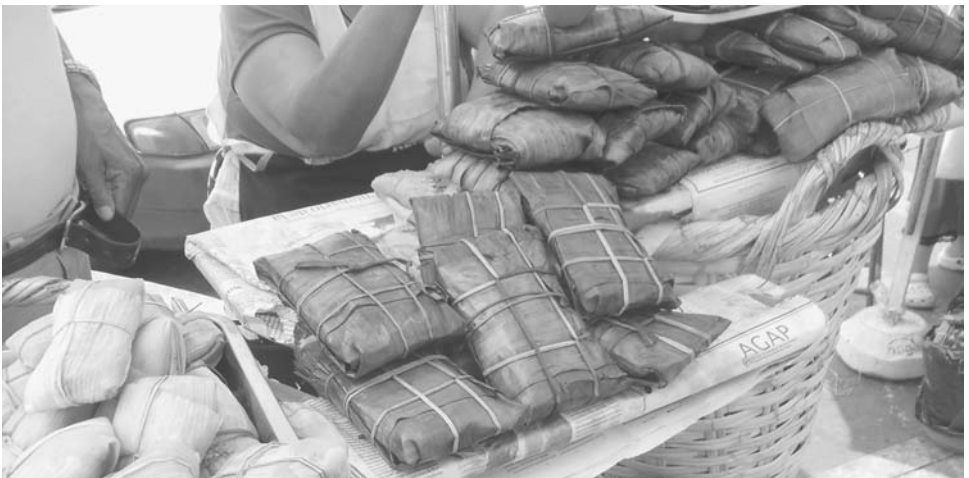
Tamales being sold in a street market in Lima, Peru.

Peru was home to many ancient cultures, the most recent being the Inca Empire, which existed for 100 years before being conquered by the Spanish in 1532. Starting in the 16th century, African slaves were brought to work in construction and domestic service. The 19th century saw the arrival of Chinese, Japanese, and European immigrants. Today about two-thirds of Peru's 30 million people are Amerindian or Mestizo (mixed European and Indian). This melting pot of cultures and traditions has created one of the most vibrant culinary cultures in South America.